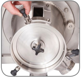
Sealed Valve Reject

There are two different reject systems available to ensure contaminants are safely and reliably rejected from the production line. The Sealed Valve Reject is completely dust-tight thus eliminating any cross contamination. The Cowbell-type diverter style reject will reject contaminated product into a separate reject bin.