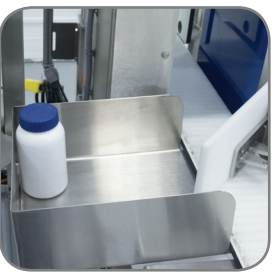
Stainless Steel Reject Tray

The Insight BottleChek is available with different reject options: A Reject Tray where rejected product is pushed off the production line into a stainless steel tray, a standard, lockable reject bin or a side-by-side transfer to another conveyor belt.