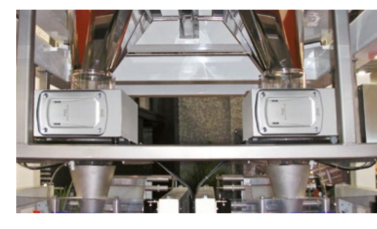
Digital analysis of the signal provided by the antenna (DSP) allows extremely high levels of sensitivity, immunity to interference and operational stability to be achieved